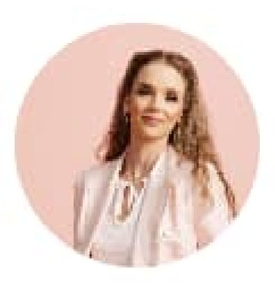
Summer Petrosius Kindship