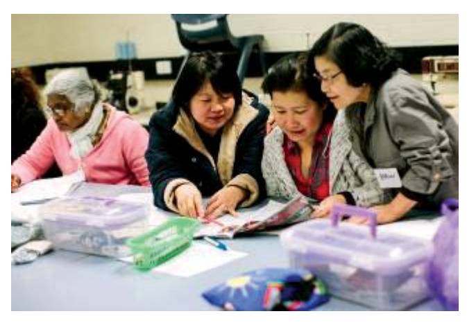
No Sweat Fashions

No Sweat Fashions is a social enterprise providing training and employment pathways for newly arrived refugees and migrants in Canberra. The aim is to deliver meaningful and long term social change and overcome barriers to employment and education. This donation will allow for a new intake of students beginning in January 2014. The funds will be used to hire a part-time training manager to train participants in advanced garment making, machining and embellishing skills.