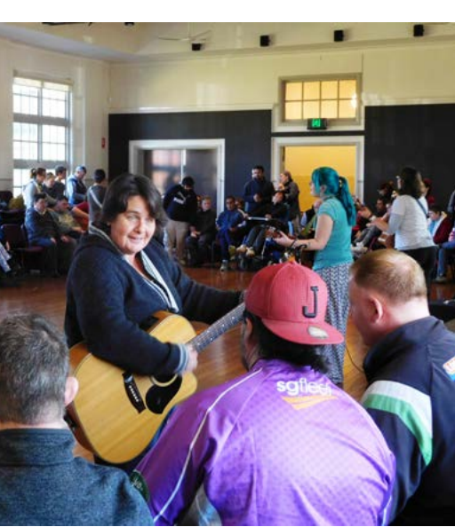
Music for Canberra - a 'MusicJam Mixed Abilities Workshop'

Radford College student volunteers participate in the games, encouraging, coaching and generally fostering a positive team spirit and ensuring each RAID player has equal participation.