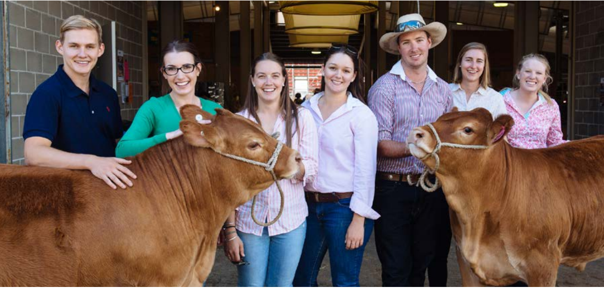
Royal Agricultural Society Foundation Rural Scholarship students 2015.

Lighthouse Business Innovation Centre provides business advice, education and training, mentorship