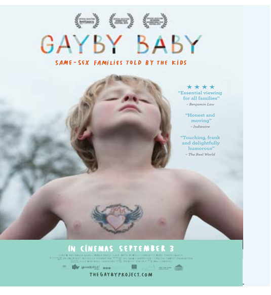
Gayby Baby - an Australian documentary about children growing up with same-sex parents.

Country Education Foundation (CEF) assists disadvantaged rural school leavers, aged 16-25 years, to help them pursue a range of post-school education and employment goals. Grants cover expenses such as transport and study expenses. Scholarships of $1,000 each assisted students from Cooma, Braidwood,