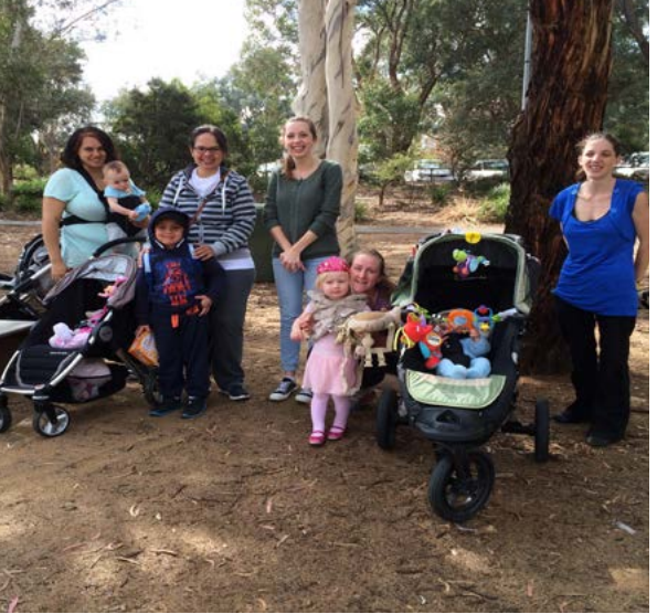
Residents of Karinya House.