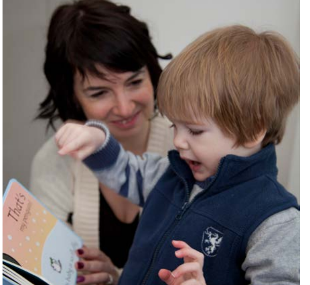
Monaro Early Intervention providing therapy for children in the Canberra community.