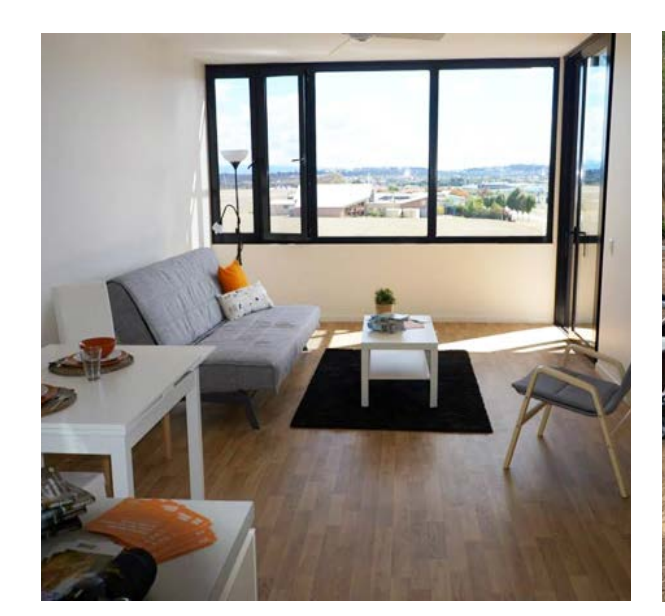
Example of a living room in an apartment at Common Ground Canberra, Gungahlin.

Karinya House provides supported accommodation, transitional housing, outreach, support groups and case work services to pregnant and parenting women and their families in crisis. Our contribution, now in its eight year, together with funding from the The Canberra Southern Cross Club, supports the much needed caseworker who assists up to 12 clients at anytime.