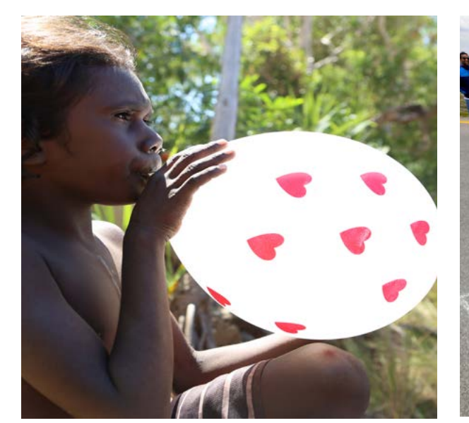
Take Heart: the quest to eliminate Rheumatic Heart Disease

The main activity of Mental Illness Education ACT (MIEACT) is mental health education and training in ACT schools. Our funding will be used to facilitate the implementation of a new interactive wellness workshop targeting Year 11 and 12 students in the ACT and surrounding NSW.