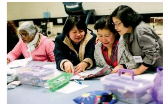
No Sweat Fashions

Social enterprise for newly arrived refugees $25,000 ($45,000 over 2 years) No Sweat Fashions is a social enterprise providing training and employment pathways for newly arrived refugees and migrants in Canberra. The aim is to deliver meaningful and long term social change and overcome barriers to employment and education. This donation will allow for a new intake of students beginning in January 2014. The funds will be used to hire a part-time training manager to train participants in advanced garment making, machining and embellishing skills.