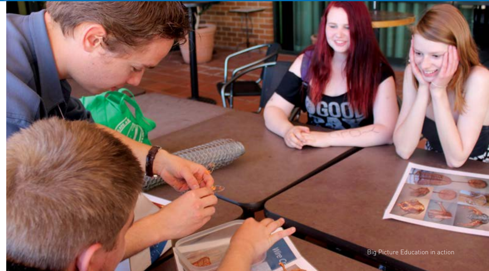
Big Picture Education in action

Global Sisters micro loans fund to assist socioeconomically disadvantaged women around Australia, who are working to escape poverty and achieve financial independence via entrepreneurship. Micro loans of up to $1,000 are loaned to women to assist in setting up or developing their business. Once repaid the loans are re-loaned to assist more women to take control of their lives, which means stronger families and communities.