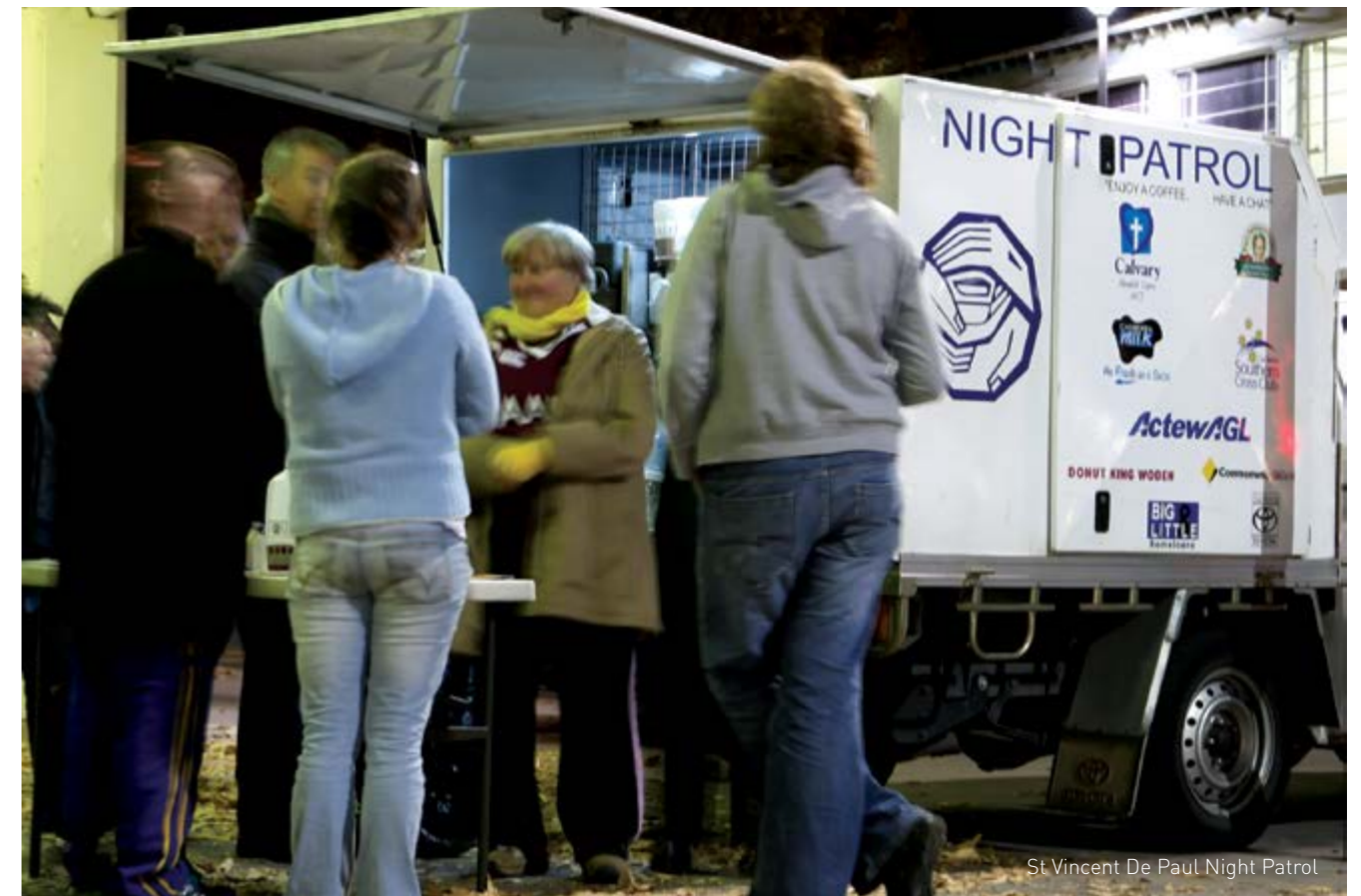
St Vincent De Paul Night Patrol

The Fresh Food for Families program provides fresh fruit and vegetables for up to 6,000 adults and children who drop into the St John's Care Centre. It also includes a free nutritious home cooked lunch once a month which is an opportunity to strengthen a sense of community. The Ainslie Primary School breakfast program provides a healthy breakfast to students three mornings a week.