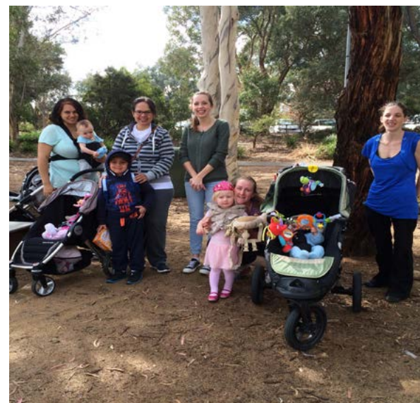
Residents of Karinya House.