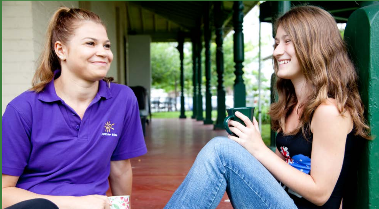
The Shine for Kids provides mentors for young offenders for more successful integration back into the community.