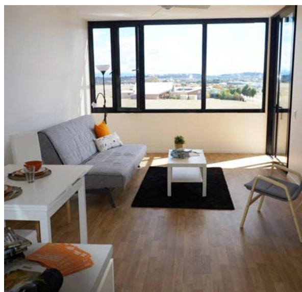
Example of a living room in an apartment at Common Ground Canberra, Gungahlin.

Karinya House provides supported accommodation, transitional housing, outreach, support groups and case work services to pregnant and parenting women and their families in crisis. Our contribution, now in its eighth year, together with funding from the The Canberra Southern Cross Club, supports the much needed caseworker who assists up to 12 clients at anytime.