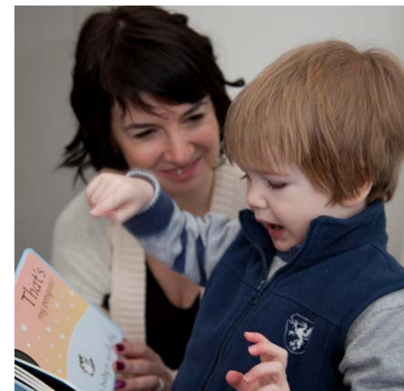
Monaro Early Intervention providing therapy for children in the Canberra community.