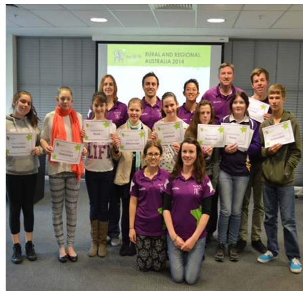
Hear for You - providing mentoring to deaf teenagers.

The Clown Doctors program treats sick children in hospital with a special kind of medicine - doses of fun, smiles and laughter.