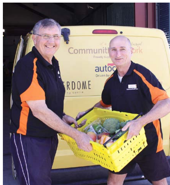
Volunteers from Communities@Work Food Rescue Program.

Breakfast is offered twice weekly prior to school commencing. An average of 60-100 students enjoy a healthy breakfast and the opportunity to take part in other activities associated with the purchasing and provision of the breakfast.