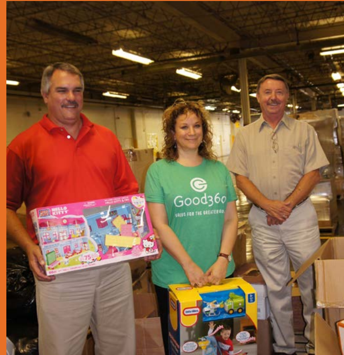
Corporate Volunteers give their time to sort high quality donated goods to go to people in need.