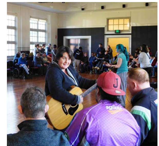
Music for Canberra - a 'MusicJam Mixed Abilities Workshop'.