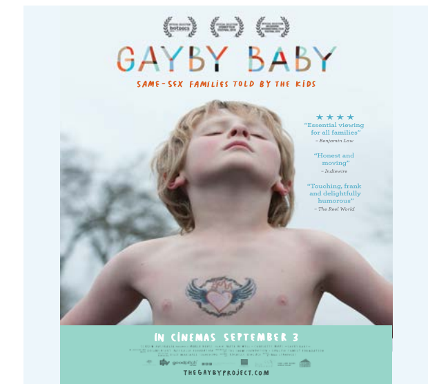
Gayby Baby - an Australian documentary about children growing up with same-sex parents.

Country Education Foundation (CEF) assists disadvantaged rural school leavers, aged 16-25 years, to help them pursue a range of post-school education and employment goals. Grants cover expenses such as transport and study expenses. Scholarships of $1,000 each assisted students from Cooma, Braidwood, Goulburn and Yass.