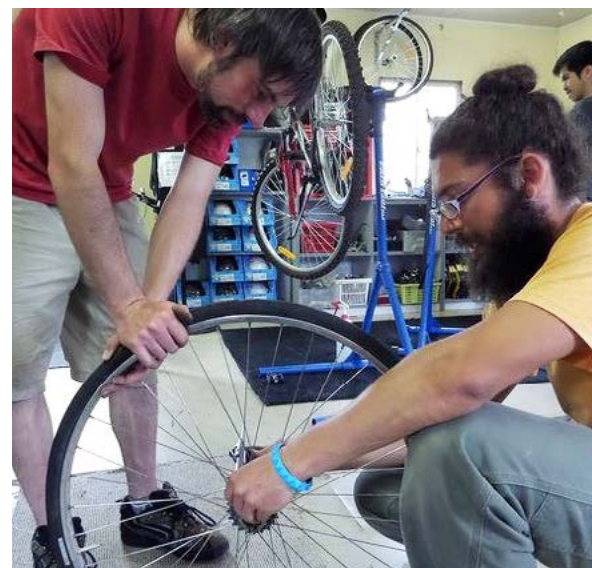
Cyclejam providing bike maintenance skills and recycling parts.