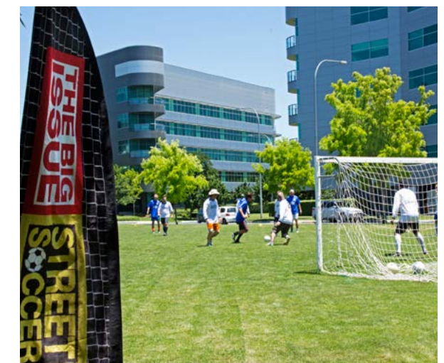
The Big Issue Street Soccer held at Brindabella Business Park.

The project also provides an additional pathway to support victims or potential victims of partner violence, increasing the safety net for people who have not yet accessed victim services.