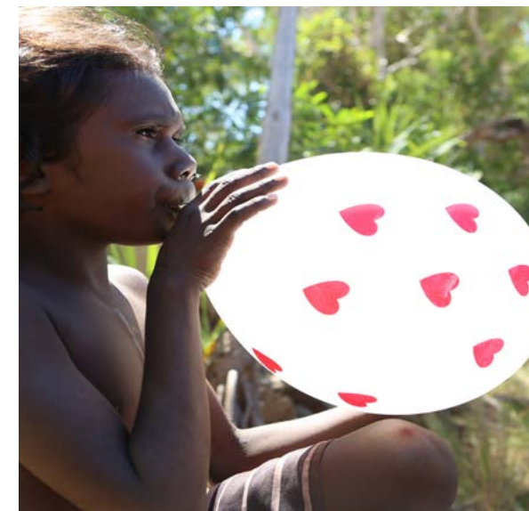
Take Heart: the quest to eliminate Rheumatic Heart Disease.

The main activity of Mental Illness Education ACT (MIEACT) is mental health education and training in ACT schools. Our funding will be used to facilitate the implementation of a new interactive wellness workshop targeting Year 11 and 12 students in the ACT and surrounding NSW.