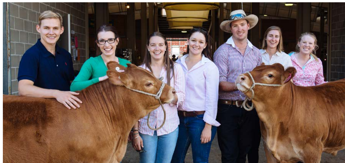
Royal Agricultural Society Foundation Rural Scholarship students 2015.

Lighthouse Business Innovation Centre provides business advice, education and training, mentorship