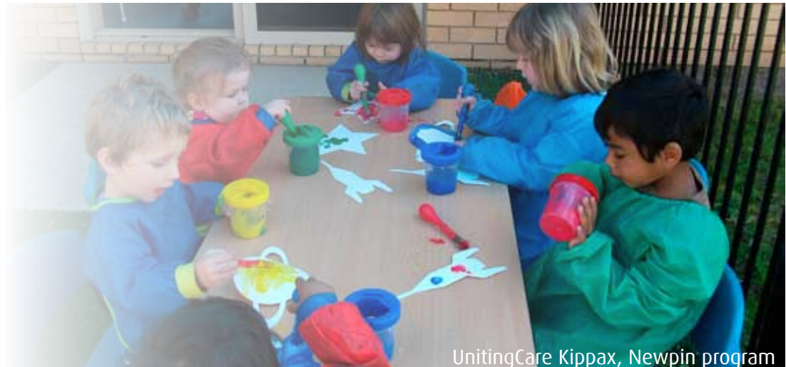
UnitingCare Kippax, Newpin program