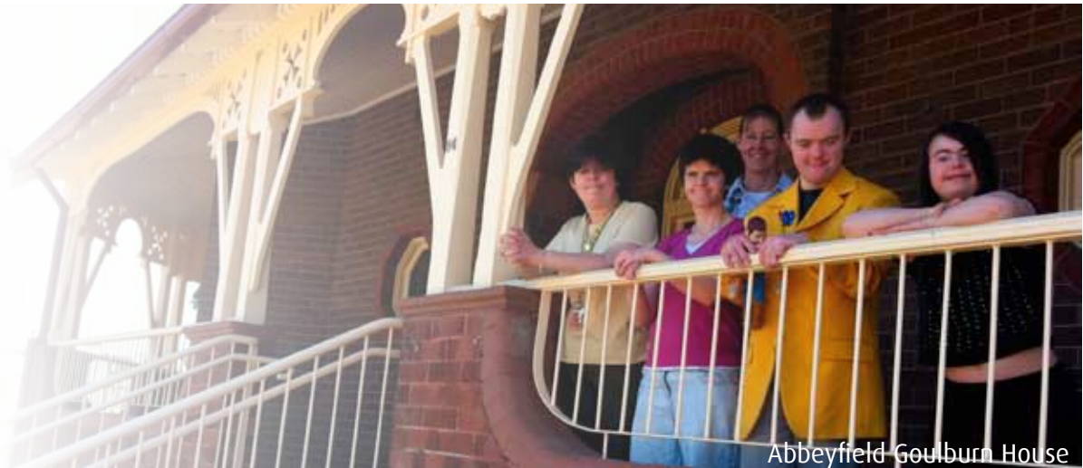
Abbeyfield Goulburn House