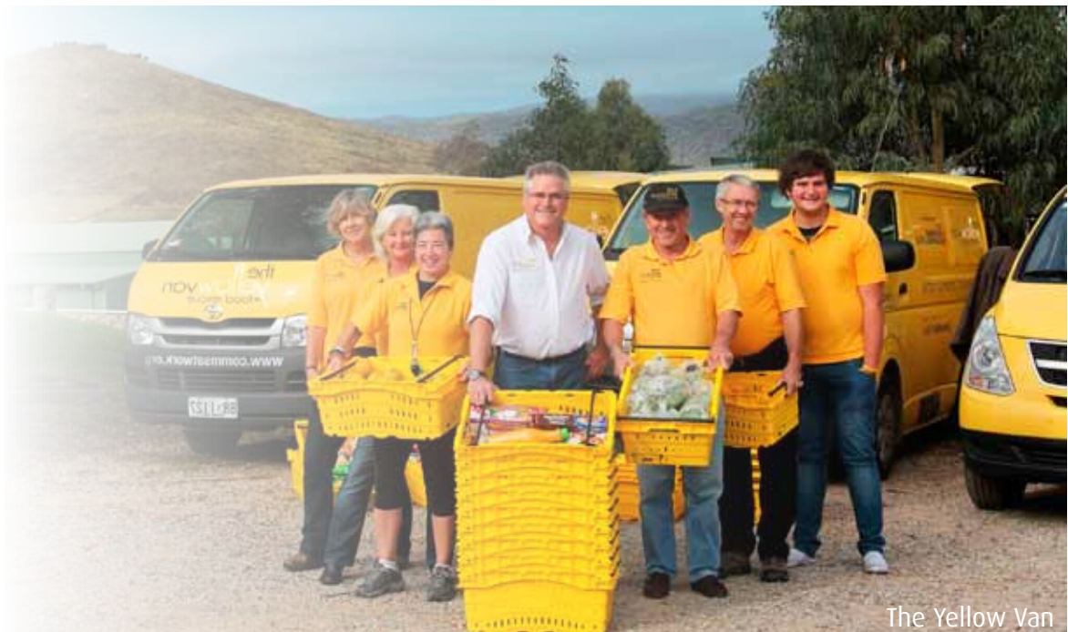
The Yellow Van