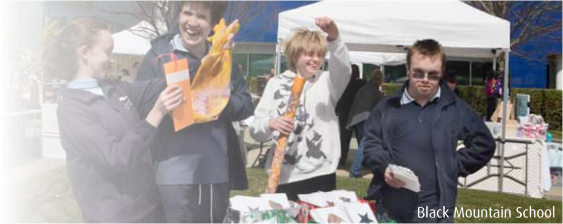
Black Mountain School