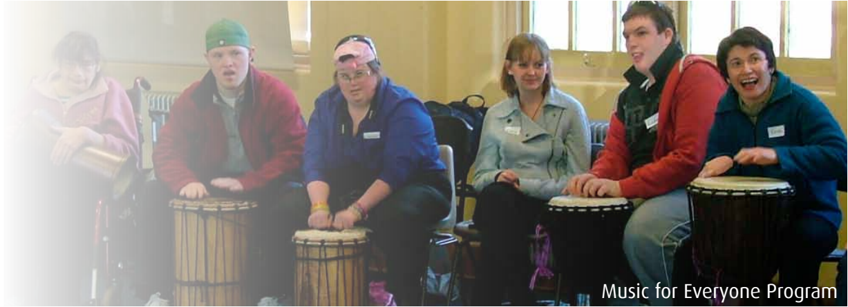
Music for Everyone Program