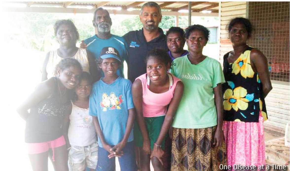
One Disease at a Time