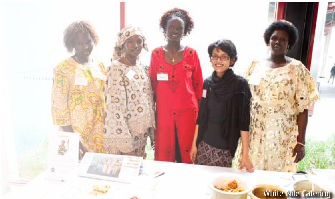
White Nile Catering