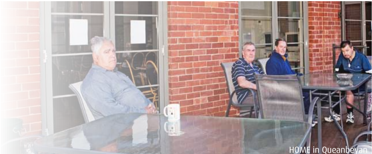
HOME in Queanbeyan