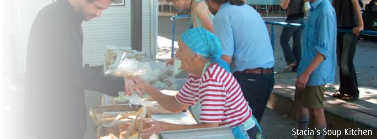
Stacia's Soup Kitchen